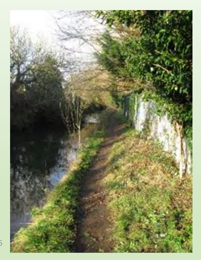
FORCE AGM 2016