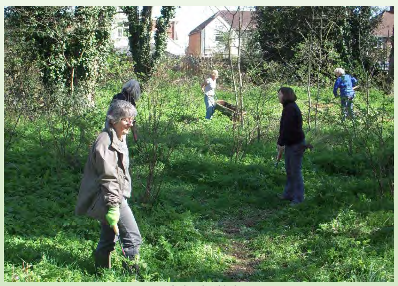
FORCE AGM 2016