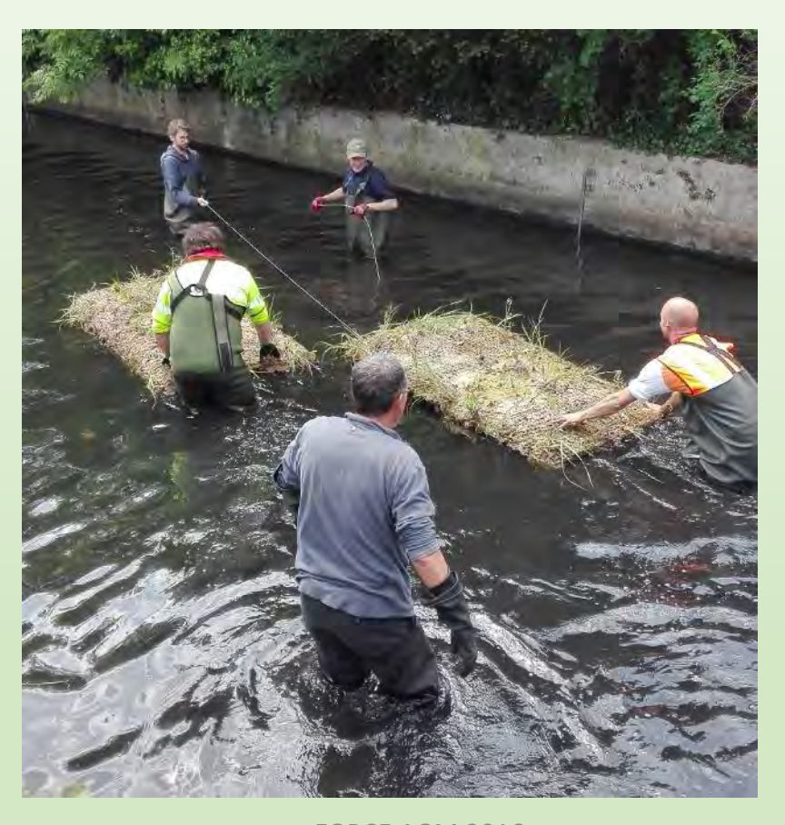
FORCE AGM 2016