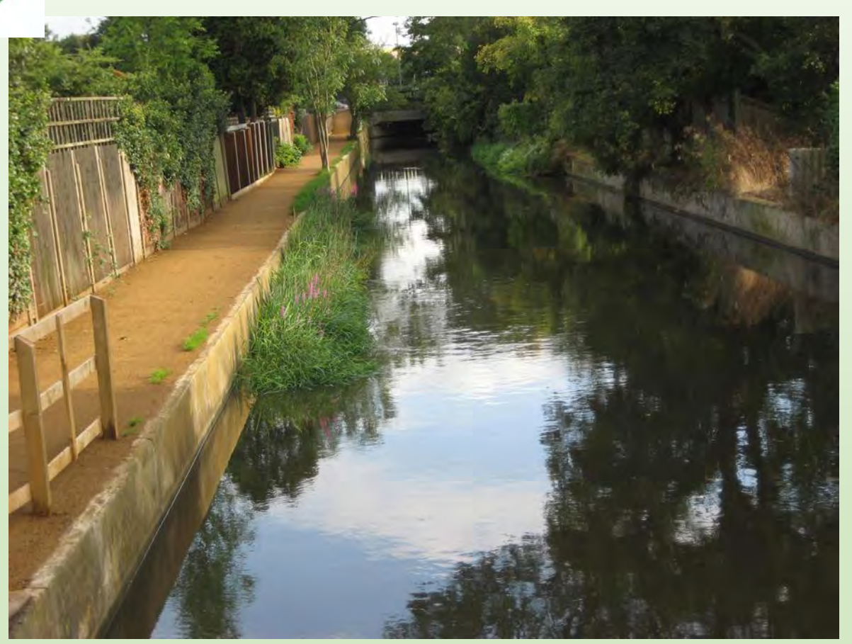
FORCE AGM 2016