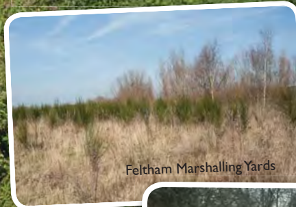
Feltham Marshalling Yards