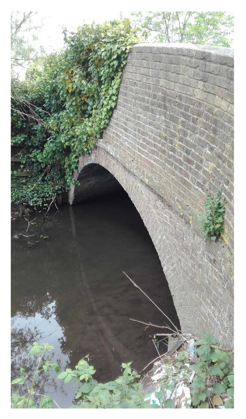
Figure 2: bridge over the Upper Duke's River in Harmondsworth

One such feature is the bridge over the Upper Duke's River in Harmondsworth, believed to be of considerable age and shown in Figure 2 below.