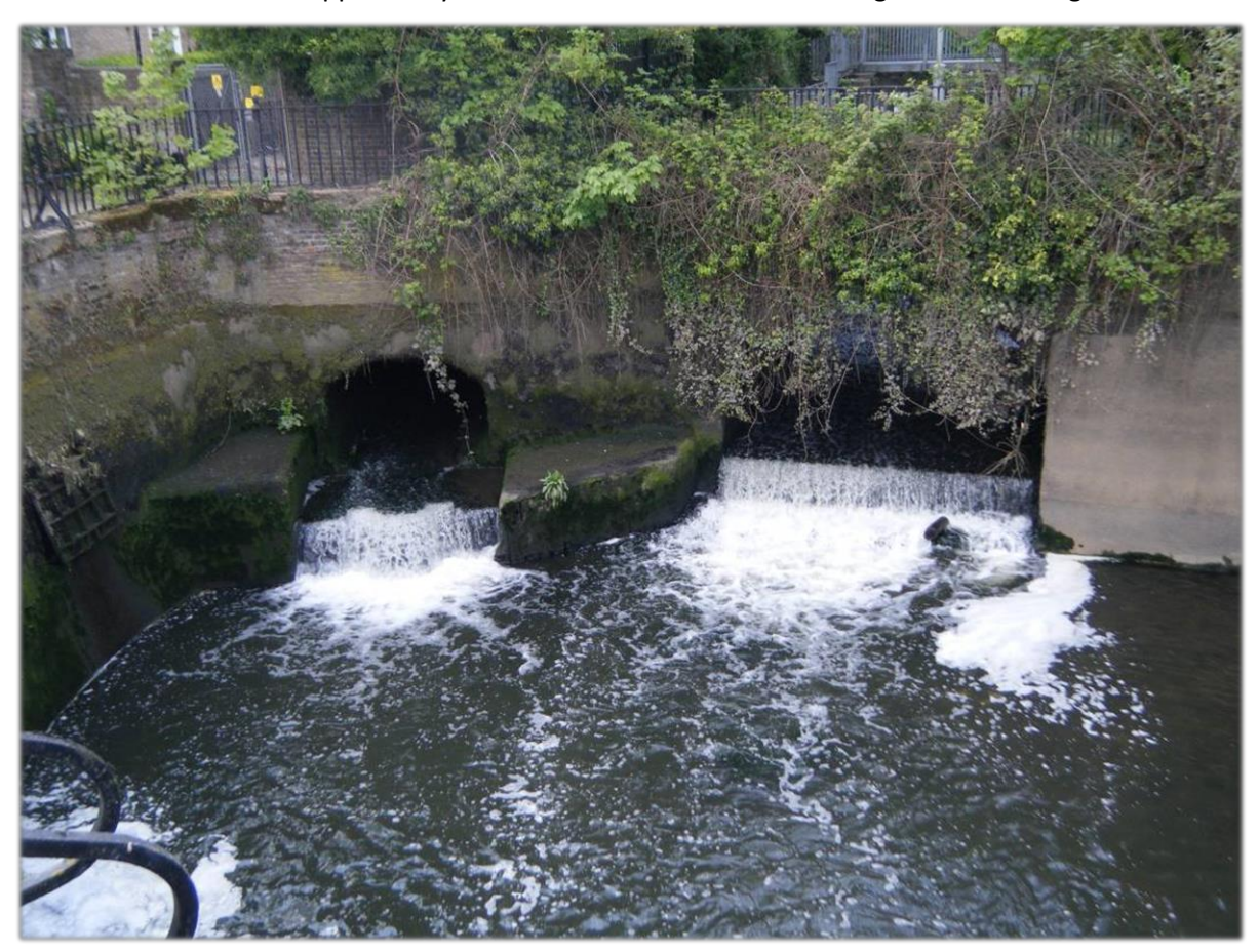
Kidd's Mill weirs in Isleworth – a fascinating historical legacy for the area and a major challenge for fish and eel passage into the DNR and Crane

It will be essential that the environmental value is protected and enhanced even as the route becomes better used as a green thoroughfare. This has been a central requirement of all the projects delivered by the partnership over the last five years. Specific projects have been identified to improve the habitat for water voles and the opportunity will be taken to create new nesting habitat for kingfishers.