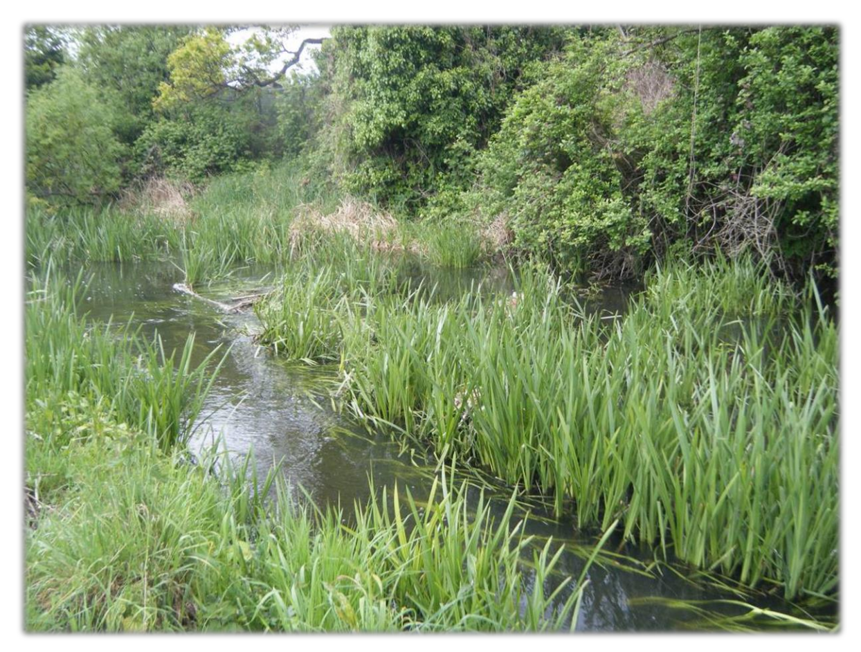
The DNR near Twickenham Stadium - a beautiful but little visited stretch of river

This project proposes to re-invigorate the access and environmental value of this part of the Duke of Northumberland's River (DNR) as a key link for wildlife and people between the River Crane and the River Thames, two of the most important green corridors in West London. This will be achieved through a series of co-ordinated projects, designed to create a newly coherent access and wildlife corridor for west London, promote its use and provide opportunities for training, education and voluntary work.