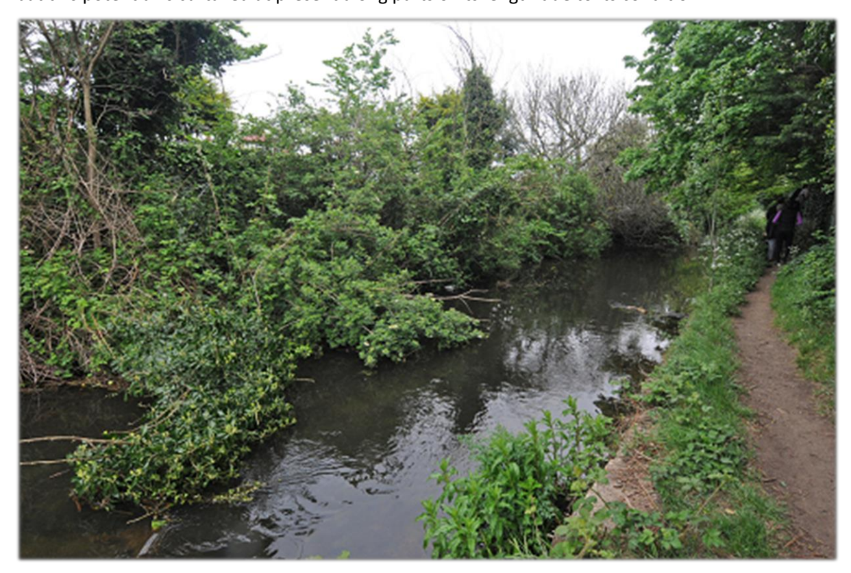
The narrow unsurfaced path along the DNR near Kneller Gardens, Twickenham

The project will help to link the areas of Twickenham, Whitton, Feltham, Hounslow and the wider Crane Valley at the south western end of the DNR with Isleworth and Brentford at the north eastern end along a green corridor of historical and environmental importance. This will improve links between communities that currently have limited connections, in part as they stretch across the borough boundary. The route has the potential to be used more for leisure, green commuting and school access but this potential is curtailed at present along parts of its length due to its condition.