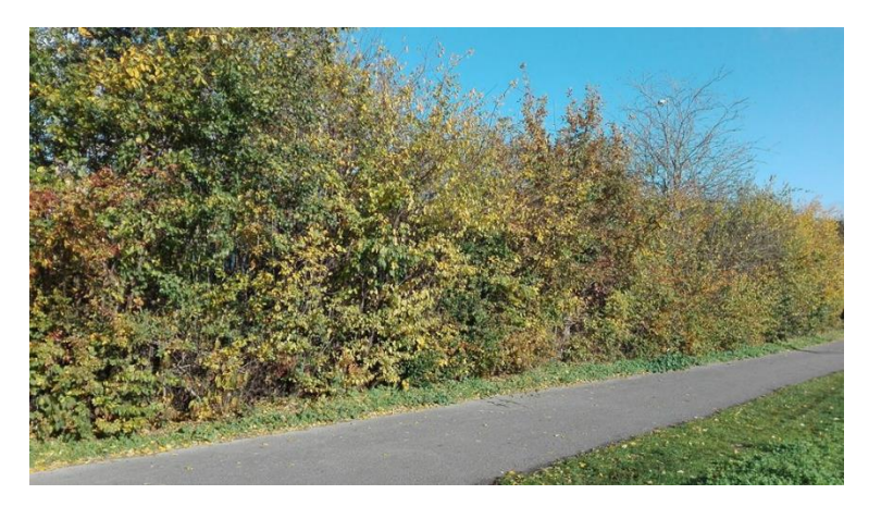
Secondary laying of a well established hedge in Crane Park.